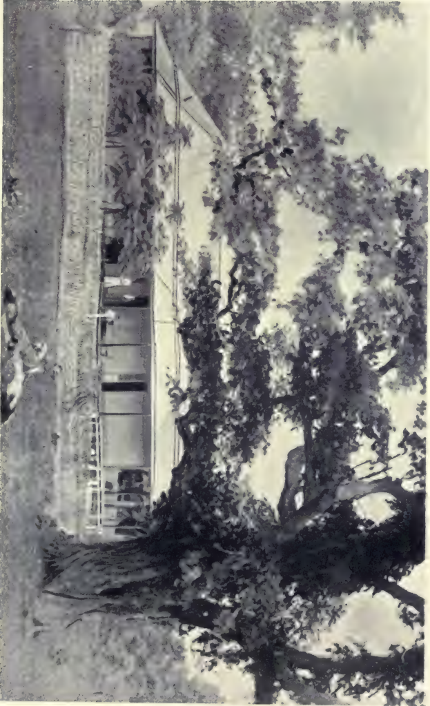
LENAKEL MISSION HOUSE